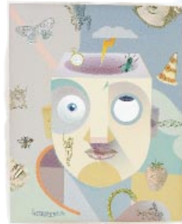
Midrange Systems Page 32