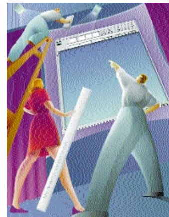
Web Teams Page 42