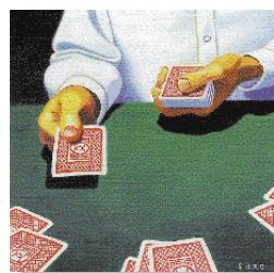
New column debuts on client/server issues Page 50