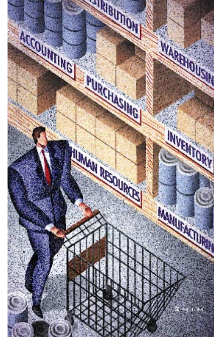
Buying Packaged Applications Page 18