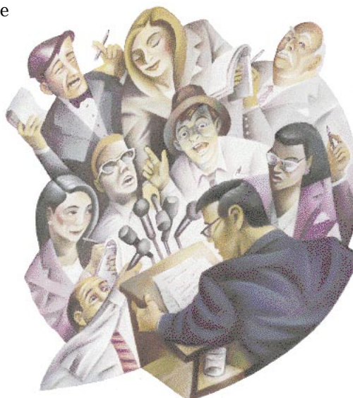
Notes Pros and Cons Page 24